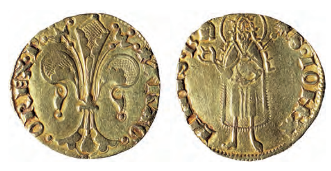
1d - Perpinyà florin of Peter III the Ceremonious, diameter: 19mm