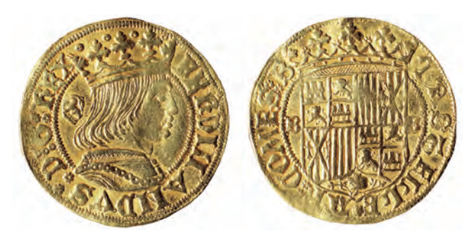
1c - Principat or ducat of Ferdinand II the Catholic (1493), diameter: 23mm