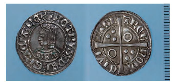
1b - Croat of Peter III the Ceremonious, diameter: 24mm